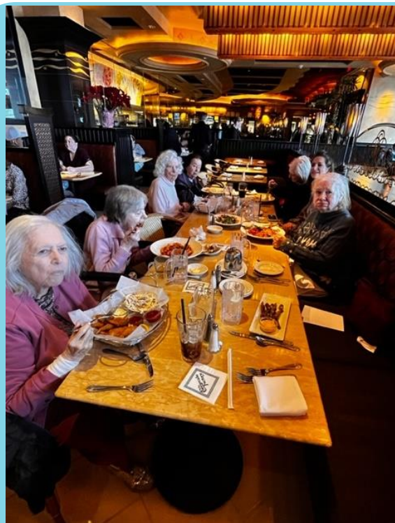
Above: Photo from our lunch trip to The Cheesecake Factory